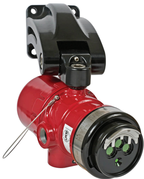
Figure 3: To "see" hydrogen flames, today's best technology is multispectrum infrared flame detection as used in the new Det-Tronics X3302 MIR flame detector shown.

On the downside, the range of MIR flame detectors is reduced by the presence of water or ice on the lens. To mitigate this problem, some detectors are equipped with lens heaters that melt ice and accelerate evaporation of water.