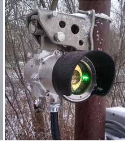
Det-Tronics FlexSight™ LS2000 line-of-sight infrared gas detector is third-party certified and is SIL 2 capable.