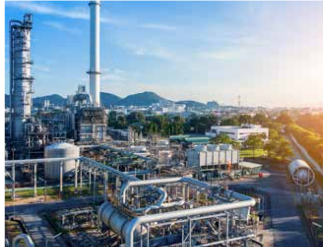
FlexSight™ LS2000 detects combustible gas between two points and is an optimal solution in perimeter monitoring applications.