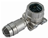
FlexSonic® Acoustic Leak Detector

** It is important to realize that the No Effect failures are no longer included in the Safe Undetected failure category according to IEC 61508, ed2, 2010.