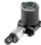
FlexVu® Universal Display with GT3000 Toxic Gas Detector